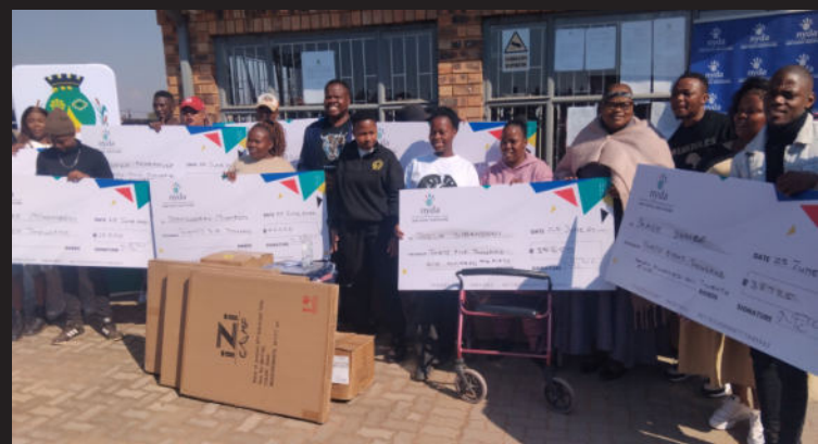
Executive Mayor Lesetja Dikgale with the 2026 MSME beneficiaries who received tools of trade

The municipality and the NYDA said the partnership aims to reduce youth unemployment by helping young entrepreneurs build sustainable businesses that contribute to the local economy.