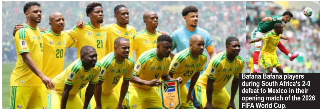
Bafana Bafana players during South Africa's 2-0 defeat to Mexico in their opening match of the 2026 FIFA World Cup.

The nation remains behind the team, with many believing that determination, improved execution and unity can help Bafana Bafana bounce back and keep their World Cup dream alive.