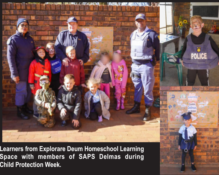
Learners from Explorare Deum Homeschool Learning Space with members of SAPS Delmas during Child Protection Week.