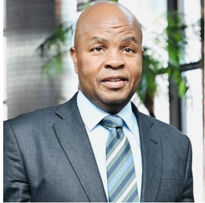
Premier Mandla Ndlovu pledges tougher audits, strengthened whistleblower protection and “no safe haven for corruption” as the Office of the Premier commits to advancing clean governance in Mpumalanga through its 2026/27 budget.

Mpumalanga if contracts were awarded unfairly rather than on merit. By strengthening controls in procurement and project management, the province aims to create a fairer environment for youth, women and small businesses to participate in the economy. “To the people of Mpumalanga, your government belongs to you,” Ndlovu said. “We will guard it, we will clean it, and we will make it work for you.” Ndlovu requested the House to approve a budget of R505,959,000 for the 2026/27 financial year. The budget is allocated as follows: Programme 1: Administration receives R197,190,000 to support the operations of the Office of the Premier. Programme 2: Institutional Development Support and Integrity Management receives R241,591,000, the largest allocation, to strengthen governance, risk management and the fight against fraud and corruption. Programme 3: Policy, Research, Performance Monitoring and Evaluation is allocated R67,178,000 to drive planning, research and performance oversight across the provincial government.