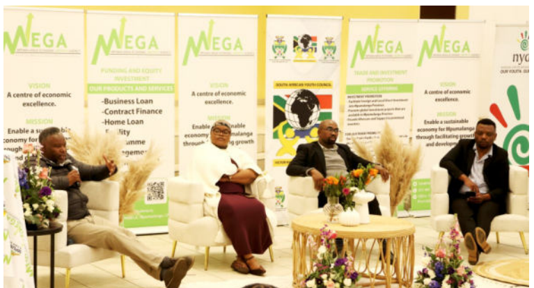
Representatives from Land Bank, NYDA, ABSA and SEDFA lead an insightful panel discussion on funding opportunities and how businesses can position themselves to access funding.