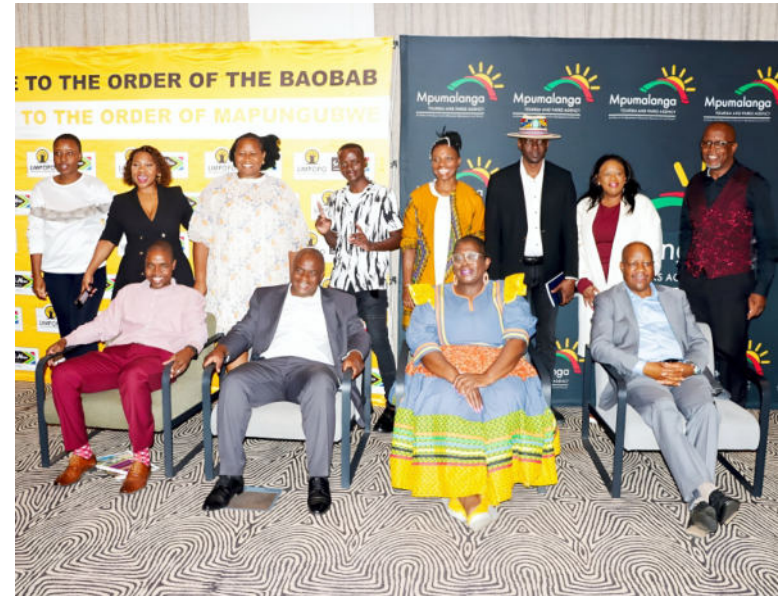
MTPA and Limpopo Tourism Agency officials pose for a photograph following the successful launch of the joint winter tourism campaign

private sector and law enforcement agencies. The two agencies are currently planning additional joint initiatives for the 2026/27 financial year, which will be announced in due course. While the Joint Winter Campaign Launch marks an important milestone, both agencies said it is only the beginning of a long-term partnership aimed at unlocking greater tourism opportunities and economic benefits for both provinces.