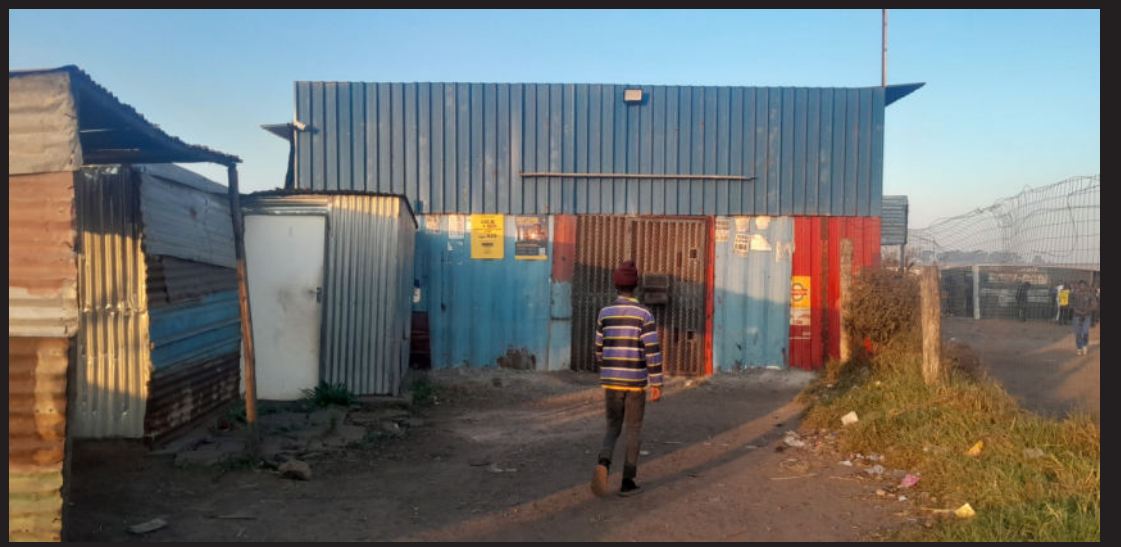
The closed shop allegedly operated by the perpetrator, situated in the Mandela Informal Settlement in Delmas.