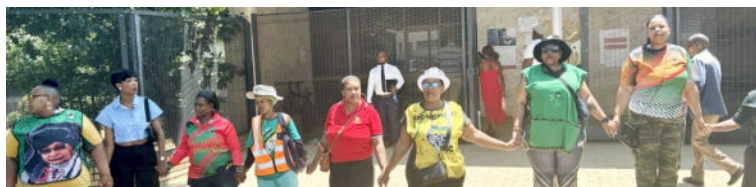
Women from different political parties hold hands outside the Middelburg Magistrate's Court in a show of unity against gender-based violence.