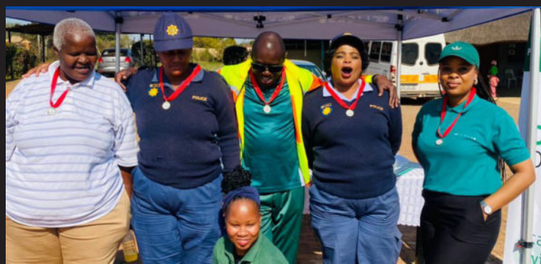
Representatives from SAPS and Clicks joined community members in supporting children at KwaThando Care Centre during the Child Protection Fun Run Awareness event.

The Department of Social Development also encouraged families to register children living with disabilities for grants and support programmes.