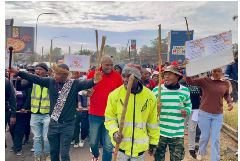
Scores of residents took to the streets in a protest led by eMalahleni locals, supported by March and March national executive