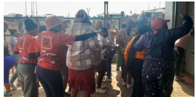
Roots Delmas employees protest outside the now-closed store

The status of the liquidation process and the workers' claims remains unclear. The publication will continue to follow developments.