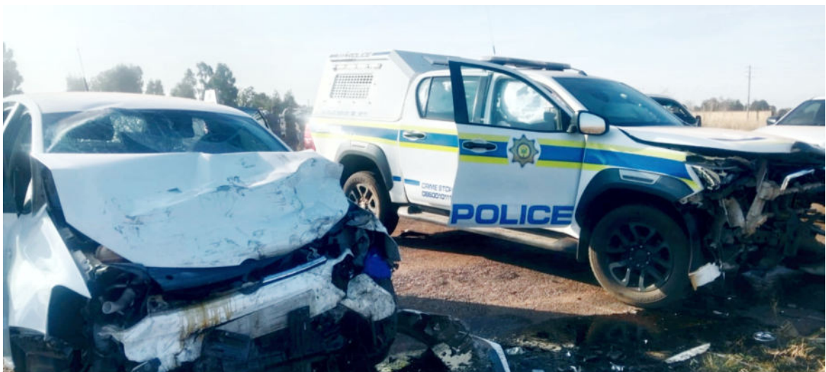
A VW Polo allegedly used by suspects to flee from Sundra where they were found offloading groceries from a truck is pictured after colliding head-on with a police van during a police chase near Delmas.

Others wished the injured officers a speedy recovery, praising their efforts in bringing the suspects to justice.