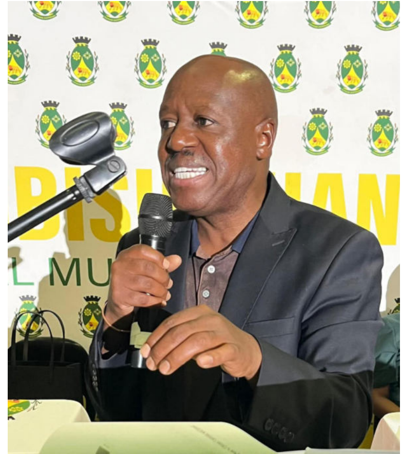
Thembisile Hani Executive Mayor Lesetja Dikgale

infrastructure, improving service delivery and promoting greater community participation in local governance.