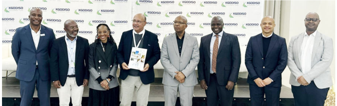
KDF management and board officials present the fund's first Integrated Report during the launch event in Johannesburg.

farmers withstand increasing climate-related shocks. The Kgodiso Development Fund concludes its first reporting cycle in a strong financial position, having achieved three consecutive clean audits. With a loan collection rate of 73% and R98 million already repaid by beneficiaries, the fund has demonstrated that investing in emerging black-owned enterprises is both a viable commercial strategy and a significant developmental success.