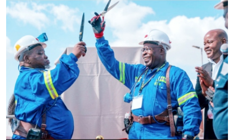
Minister of Mineral and Petroleum Resources Gwede Mantashe and Ben Magara, Chief Executive Officer of Exxaro Resources

Eskom and Exxaro signed a Memorandum of Understanding (MoU) in 2025 focusing on emissions reduction, carbon capture and initiatives aimed at supporting a responsible just energy transition. For communities surrounding eMalahleni, Kriel and Ga-Nala, the project is expected to bring renewed economic activity and long-term employment opportunities, reinforcing Mpumalanga's role at the centre of South Africa's energy economy.