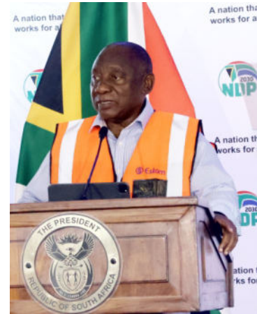
President Cyril Ramaphosa faces renewed political pressure after the Constitutional Court ordered Parliament to reconsider the Phala Phala Section 89 panel report.

Parliament will now have to determine a date to bring the report back before the House.