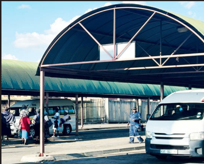
Commuters queue for taxis at a taxi rank, where fares increased on 01 May 2026 as operators passed higher fuel costs onto passengers travelling to Middelburg's CBD and surrounding areas

"I now spend almost R40 more per week just to get to work. That's food and airtime money gone. We don't have a choice though, there's no other transport," he said.