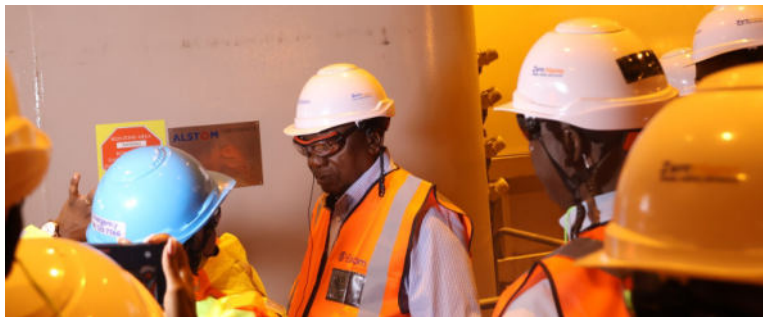
President Cyril Ramaphosa inside the power-generating plant

"the path of the righteous winds upwards to flee from hell beneath us" Prov 15:24