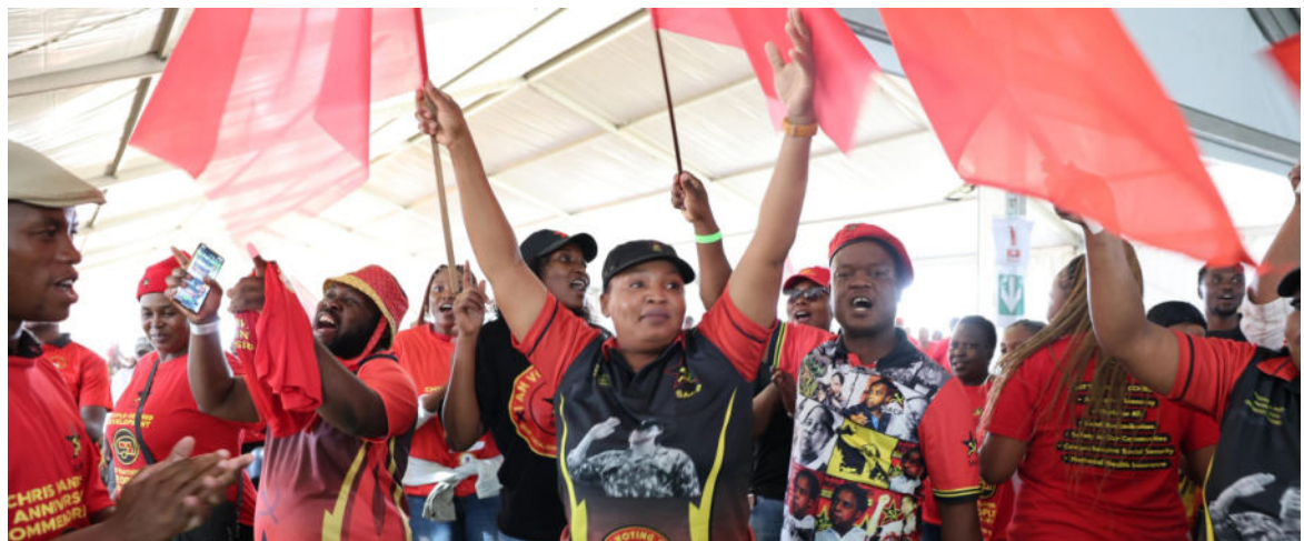
South African Communist Party (SACP) members

As the country marks 33 years since his passing, the message from the commemoration was clear — Hani's vision of unity, equality and economic freedom remains as relevant today as it was during the liberation struggle.