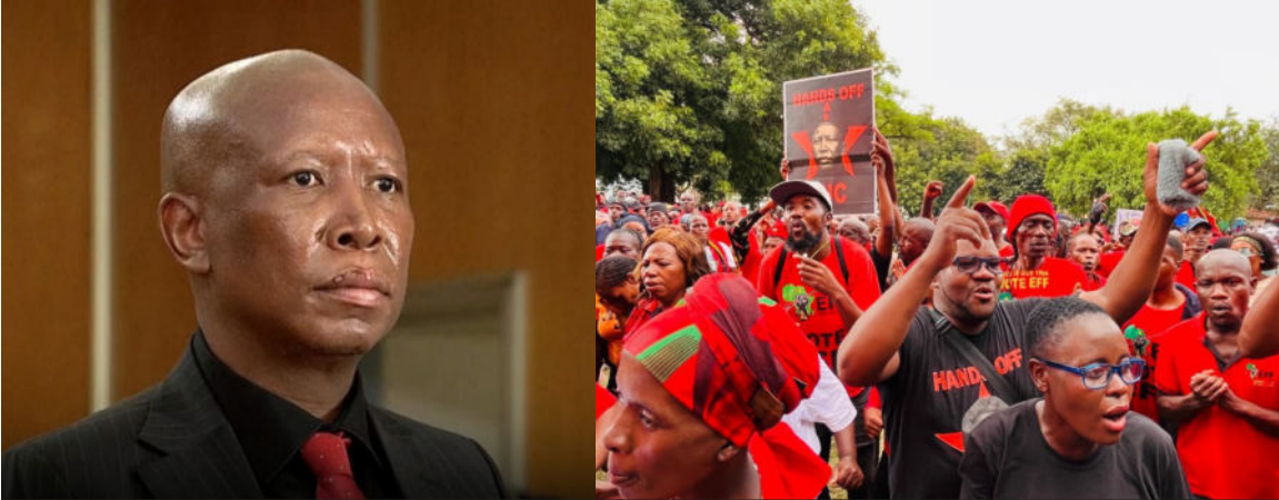
EFF President Julius Malema and Mpumalanga EFF members who came in numbers to Mbombela to follow court proceedings, watching on a big screen

The case also carries potential implications for Malema's position in Parliament. In terms of Section 47 of the Constitution, a Member of Parliament is disqualified if convicted of an offence and sentenced to more than 12 months' imprisonment without the option of a fine. However, such disqualification only takes effect once all appeal processes have been concluded or the time to appeal has expired. This means Malema may remain in office while his appeal is underway. If ultimately unsuccessful, the disqualification would remain in place for five years after the completion of the sentence. Sentences that include the option of a fine do not trigger this provision, but the final outcome of the appeal process will be critical in determining his future in Parliament.