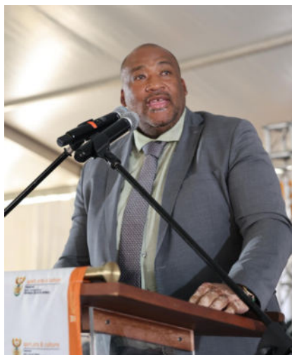
Minister of Sport, Arts and Culture, Gayton McKenzie, addressing the audience