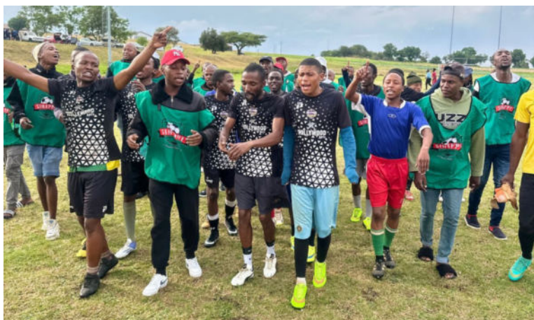
Sihappy S'ngaphezulu FC players celebrate after their dominant 11-0 victory over Vukuzenzele United Palace.

The victory marks a significant shift in the title race, with Sihappy S'ngaphezulu FC now leading the LFA Promotional League standings.