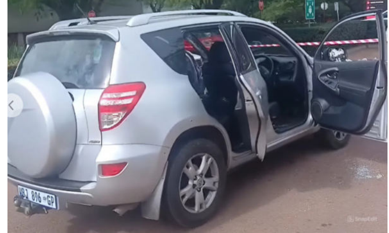
A Toyota RAV4 fitted with false registration plates, suspected to have been used as a getaway vehicle