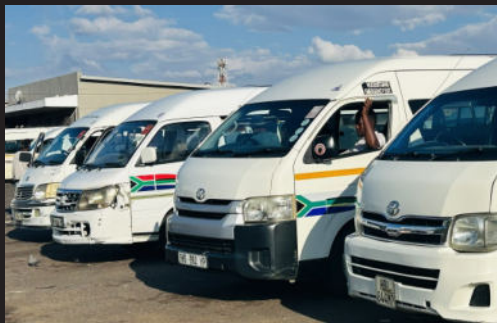
From 01 May, commuters in Middelburg and Mhluzi will see a R2 increase in taxi fares.

"While we are also feeling the pressure of rising fuel costs, it is important that we consult our members before making any changes," he added.